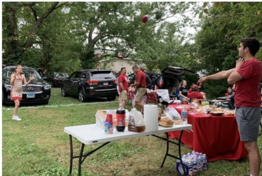
Top left: Hoosier Escape House – October 2019; Top right: Hoosiers Outrun Cancer – September 2019 Above: Football tailgate September 2019