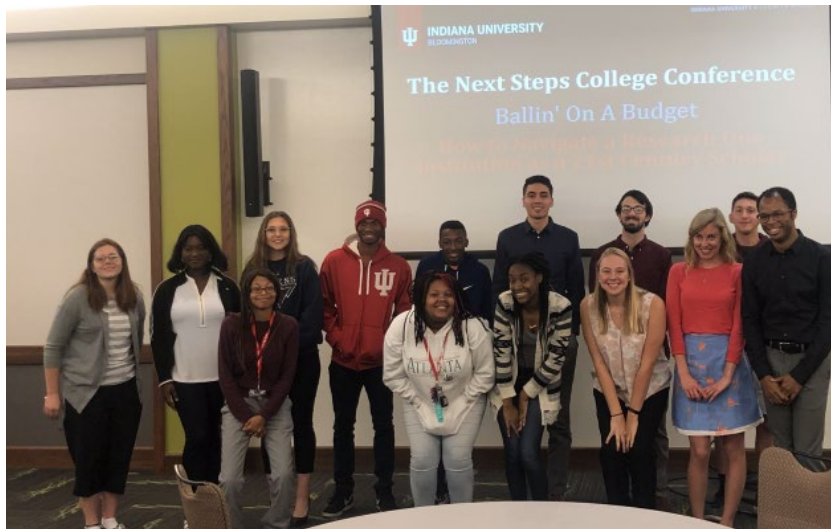
2019 The Next Steps College Conference (3 Leadership Corps Members presented)