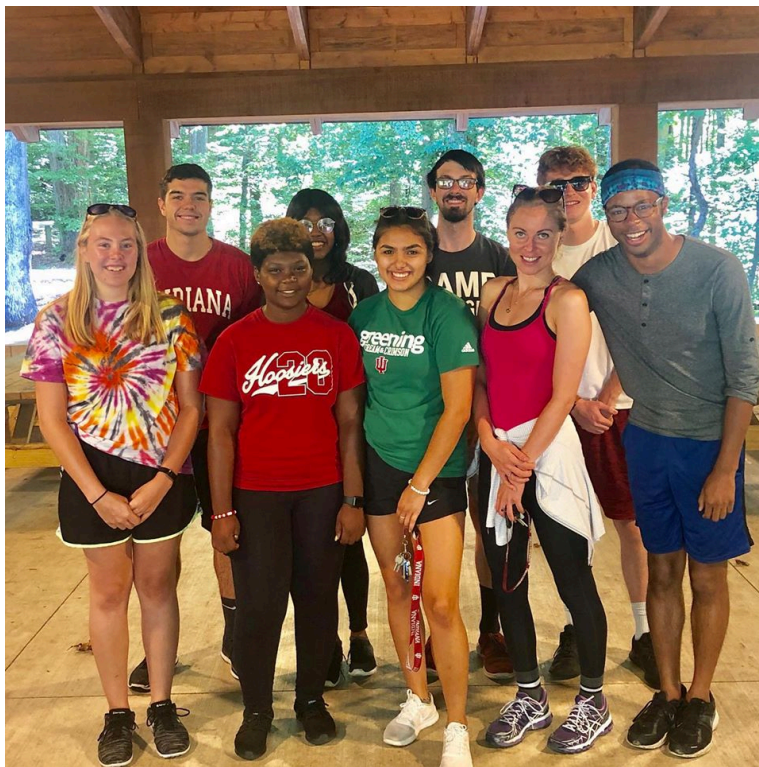
2019 Leadership Corps Retreat at McCormick's Creek State Park

Multiple groups of scholars helped Girls Inc. at their Holiday Hoopla event this past December. Some were wrapping presents for families and some manned the hot chocolate station to help keep everyone warm! There were also scholars helping kids make gingerbread houses and Christmas ornaments. After the event, we helped clean up and tear down so the facilities could be used again as soon as possible.