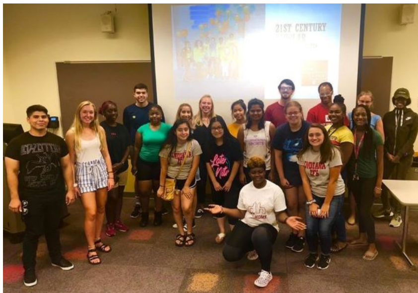
Leadership Corps Call-Out Meeting last year (Sept. 4, 2019)